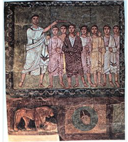
Samuel anoints David, Dura Europos , Syria. Date: 3rd century CE.

In Judaism, Ha-mashiach (הַמָּשִׁיחַ, 'the Messiah'), [3][a] often referred to as melekh ha-mashiach (מֶלֶךְ הַמָּשִׁיחַ, 'King Messiah'), [5] is the Jewish leader, physically descended from the paternal Davidic line through King David and King Solomon . He will accomplish predetermined things in a future arrival, including the unification of the tribes of Israel, [6] the gathering of all Jews to Eretz Israel , the rebuilding of the Temple in Jerusalem, the ushering in of a Messianic Age of global universal peace, [7] and the annunciation of the world to come. [1][2]