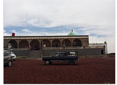
The Druze maqam of Al-masih (Jesus) in As-Suwayda Governorate

In the Druze faith, Jesus is considered the Messiah and one of God's important prophets, [70][71] being among the seven prophets who appeared in different periods of history. [70][71] According to the Druze manuscripts Jesus is the Greatest Imam and the incarnation of Ultimate Reason (Akl) on earth and the first cosmic principle (Hadd), [72] and regards Jesus and Hamza ibn Ali as the incarnations of one of the five great celestial powers, who form part of their system. [73] Druze doctrines include the beliefs that Jesus was born of a virgin named Mary, performed miracles, and died by crucifixion. [72] In the Druze tradition, Jesus is known under three titles: the True Messiah ( al-Masih al-Haq ), the Messiah of all Nations ( Masih al-Umam ), and the Messiah of Sinners. This is due, respectively, to the belief that Jesus delivered the true Gospel message, the belief that he was the Saviour of all nations, and the belief that he offers forgiveness. [74]