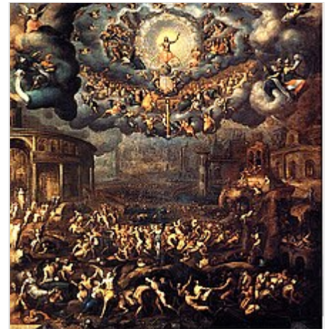
The Last Judgment , by Jean Cousin the Younger (c. late 16th century)

Originating from the concept in Judaism, the messiah in Christianity is called the Christ—from Greek khristós (χριστός), translating the Hebrew word of the same meaning. [8] 'Christ' became the accepted Christian designation and title of Jesus of Nazareth , as Christians believe that the messianic prophecies in the Old Testament—that he is descended from the Davidic line, and was declared King of the Jews —were fulfilled in his mission , death , and resurrection , while the rest of the prophecies—that he will usher in a Messianic Age and the world to come —will be fulfilled at his Second Coming . Some Christian denominations, such as Catholicism , instead believe in amillenialist theology, but the Catholic Church has not adopted this term. [41]