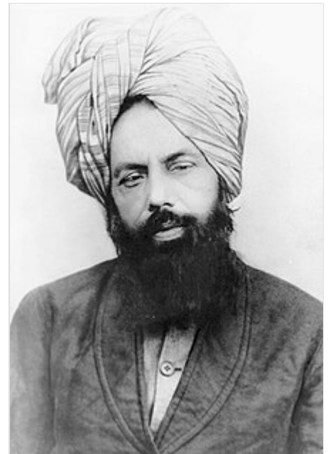
Mirza Ghulam Ahmad, founder of the Ahmadiyya Movement in Islam, considered by Ahmadis to be the Promised Messiah of the latter days.

Ahmadis believe that the prophecies concerning the Mahdi and the second coming of Jesus have been fulfilled in Mirza Ghulam Ahmad (1835–1908), the founder of the Ahmadiyya Movement. Unlike mainstream Muslims, the Ahmadis do not believe that Jesus is alive in heaven, but that he survived the crucifixion and migrated towards the east where he died a natural death and that Ghulam Ahmad was only the promised spiritual second coming and likeness of Jesus, the promised Messiah and Mahdi. [67] He also claimed to have appeared in the likeness of Krishna and that his advent fulfilled certain prophecies found in Hindu scriptures. [68] He stated that the founder of Sikhism was a Muslim saint, who was a reflection of the religious challenges he perceived to be occurring. [69] Ghulam Ahmad wrote Barahin-e-Ahmadiyya , in 1880, which incorporated Indian, Sufi, Islamic and Western aspects in order to give life to Islam in the face of the British Raj , Protestant Christianity, and rising Hinduism. He later declared himself the Promised Messiah and the Mahdi following Divine revelations in 1891. Ghulam Ahmad argued that Jesus had appeared 1300 years after the formation of the Muslim community and stressed the need for a current Messiah, in turn claiming that he himself embodied both the Mahdi and the Messiah. Ghulam Ahmad was supported by Muslims who especially felt oppressed by Christian and Hindu missionaries. [69]